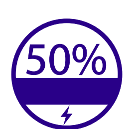
Charge 50% Faster

Enclosured with metal feel coating in gold finish, this card holder shape power bank is the handy gadget that you will take along for every day, every occasion.